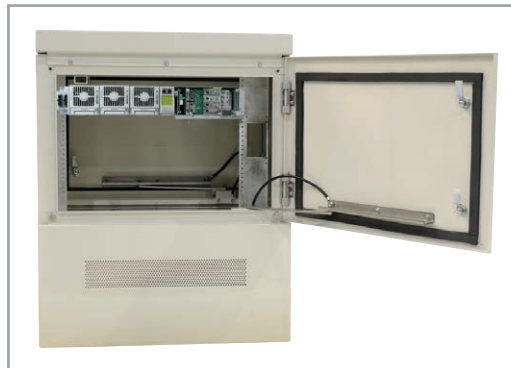
Table on page 10) Enclosures ordered with thermoelectric coolers and air conditioners incorporate insulation to maximize cooling capacity.

Door-mounted climate control options include air conditioners (850 to 19,000 BTU) equipped with internal heaters, air-to-air heat exchangers (1000W to 2800W), thermoelectric (Peltier) coolers (200W per unit), and fan/filters. (See the