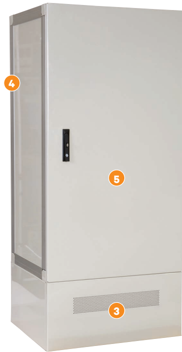
Vertiv XTE 601 Series