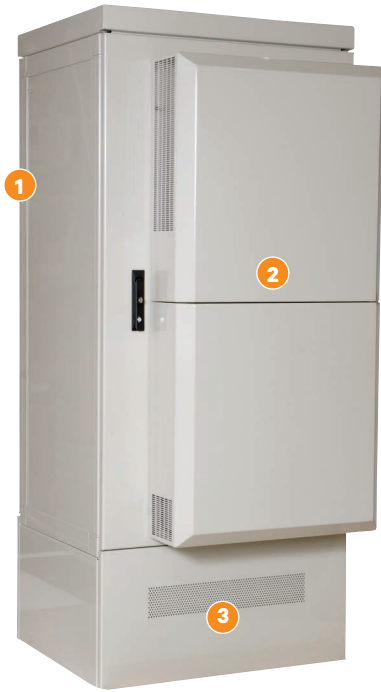
Vertiv XTE 601 Series (shown with integrated heat exchanger)