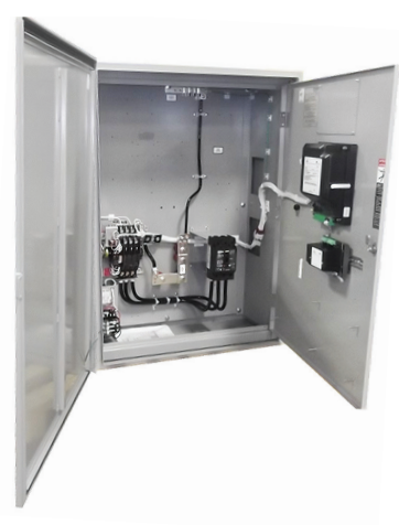
ASCO SERIES 300 SE Rated 200 amperes in Type 3R enclosure