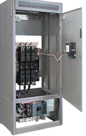
ASCO SERIES 300 SE Rated 800 amperes Type 1 enclosure