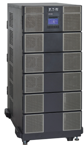
12-slot cabinet is scalable to 20 kVA (N + 1) in a 21U cabinet