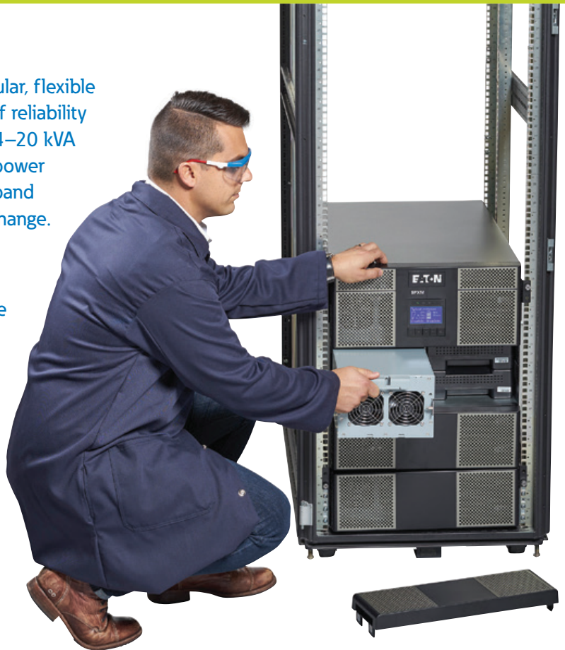
Easy hot-swappable power and battery modules

The plug-and-play power and battery modules are user replaceable so you can add them as needed without a service call or having to put a redundant system in bypass. With its low initial investment, online double-conversion technology, Eaton ABM® technology and high efficiency mode, you never have to compromise reliability for efficiency.