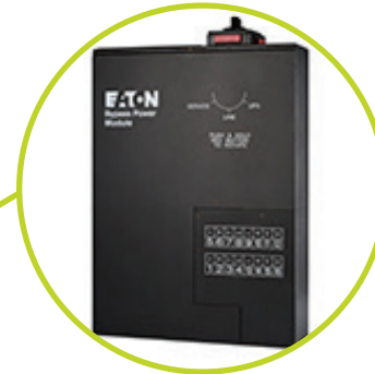
Protect against downtime during equipment maintenance with an external bypass power module