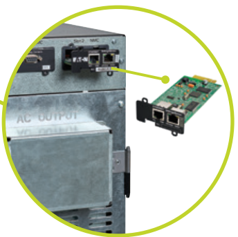
2 mini-slot ports for options using Network-MS gives access to Eaton's software offerings