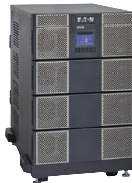
8-slot cabinet is scalable to 16 kVA in a 14U cabinet