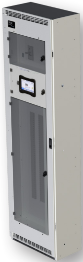
Single 12" x 24"