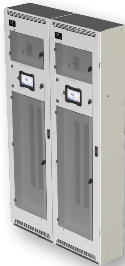
Side by Side 12" x 48"