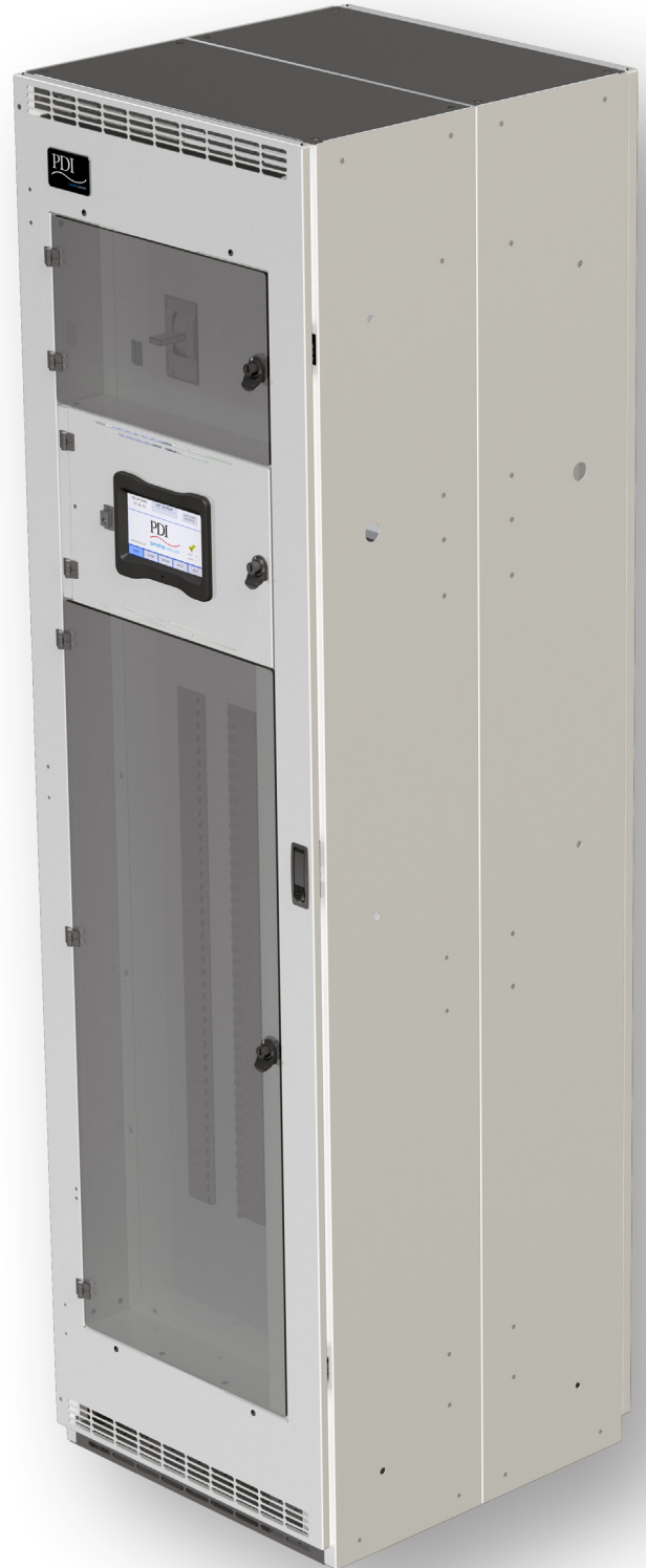
Back to Back 24" x 24"