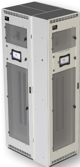
Back to Back and One Side - 24" x 36"