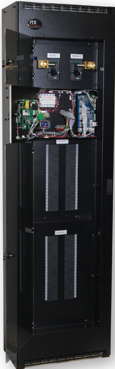
Mission Critical Modular Compact RPP

With over 150 possible configurations, the Modular Compact Remote Power Panel is the most versatile RPP on the market today. Its 12" x 24" footprint allows wall-mount, in-tile, on-tile and multi-unit configurations and can be field modified. When combined with Controls and High Voltage compartmentalization, BCMS Monitoring, Trapped Key Interlocking and multiple panelboards schemas the Modular Compact RPP can be adapted to the most demanding mission critical facilities.