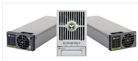
High-Efficiency eSure Rectifiers R48-3500e3 (left) R48-3500e (center) & R48-2000e3 (right)

The NetSure 7100 system is ideal for wireless, and wireline applications, including cell sites, MTSOs, small COs, datacenters, co-locations, huts, vaults and enclosures.