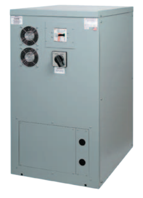
Typical 10-45 kVA Unit